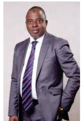
Hon. (Engr.) Abdullahi Olowa

Workers were however, provided with sophisticated work tools to ease their burden as well as yield more productivity.