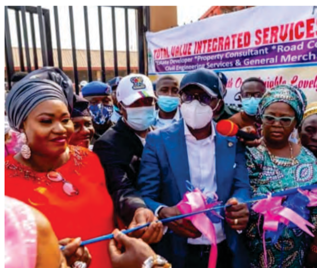
Governor, Babajide Sanwo-Olu as he cut the tape during the commissioning of the council complex