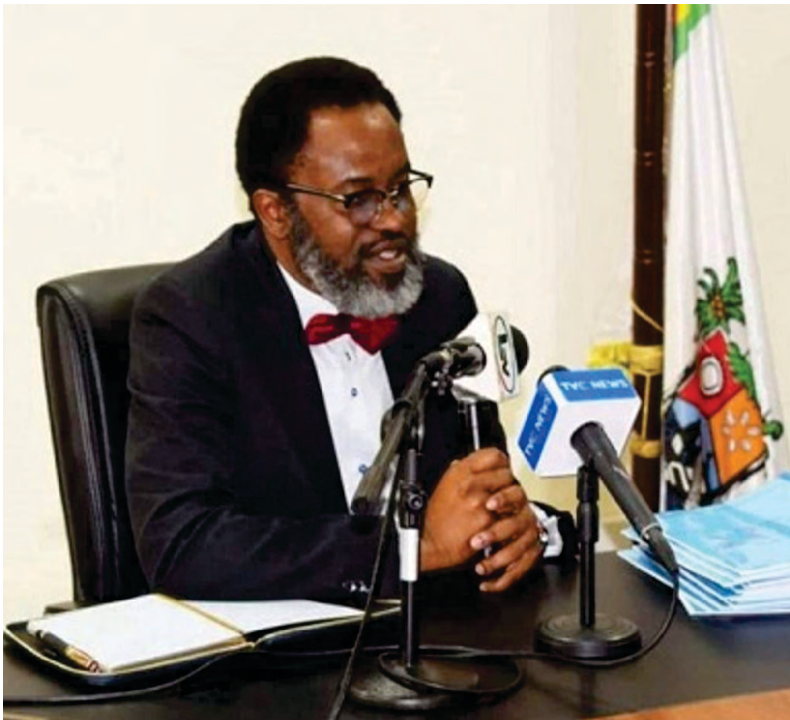
Justice, Mr. Moyosore Onigbanjo

"The breakdown of the cases shows 4150 domestic violence, 177 rape, 255 attempts to commit rape/sexual assault, 246 sexual assaults by penetration /threat, 877 others, not taking responsibilities of children, neglect, custody of the child, Non-GBV, among others, 436 child abuse/Physical assaults, 271 Defilement cases, 13 defilement by minor to minor, 454 child labour, a b d u c t i o n neglect/others, 148 sexual harassment/molestation cases.