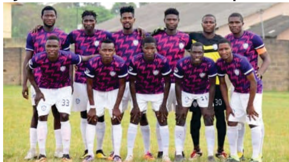
Business Atlantic FC